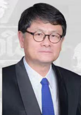
Prof. Dr. Anek Laothamatas Ministry of Higher Education, Science, Research, and Innovation Thailand